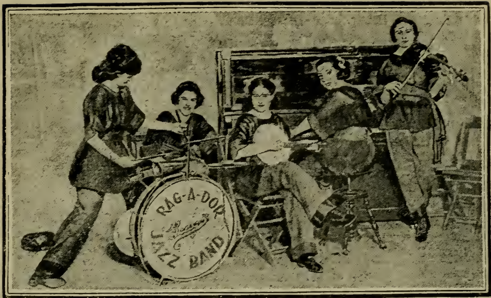
Jazz Band that performed for Church. Young women dressed as men!